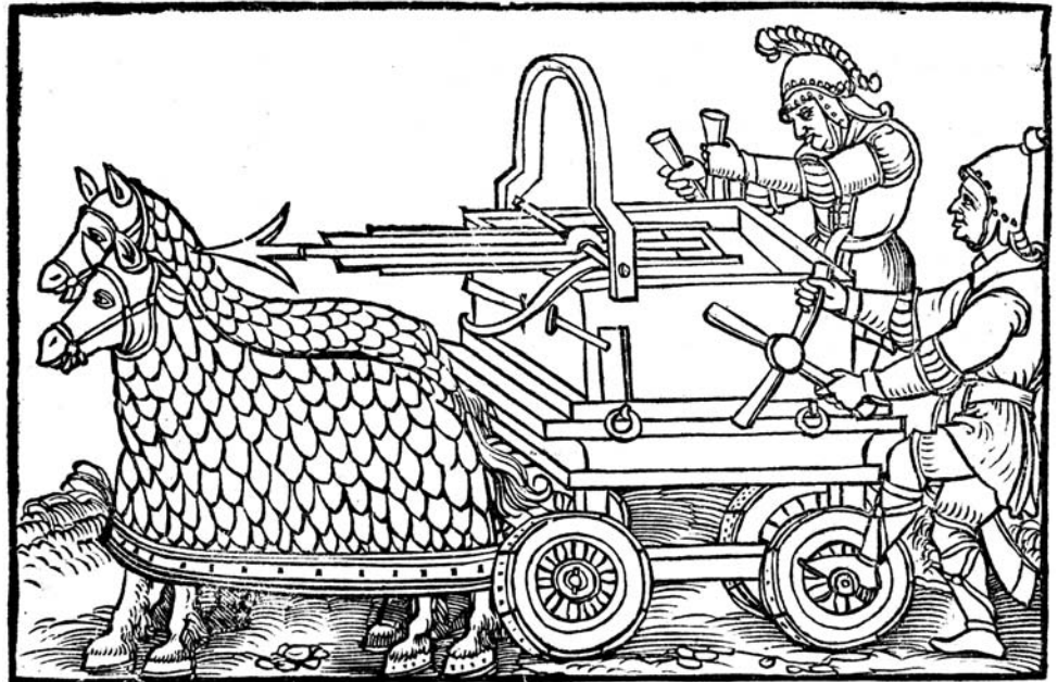
Exemplum balistae quadrirotis. Notitia utraque cum orientis turn occidentisultra Arcadii Honorique Caesarum tempora, A.D. MDLII, De Rebus Bellicus (1522). Example of a four-wheeled ballista.