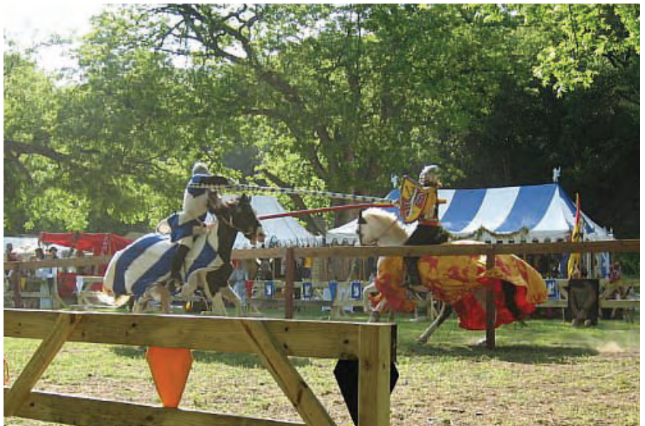
at the Lysts of Castleton