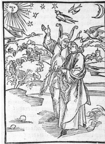
Stargazing, woodcut attributed to Albrecht Durer, from Stultifera navis (Ship of Fools) by Sebastian Brant, published by Johann Bergmann, Basel, 1498.