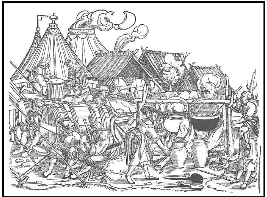
The Siege of Munster Detail 7 by Erhard Schoen c1536